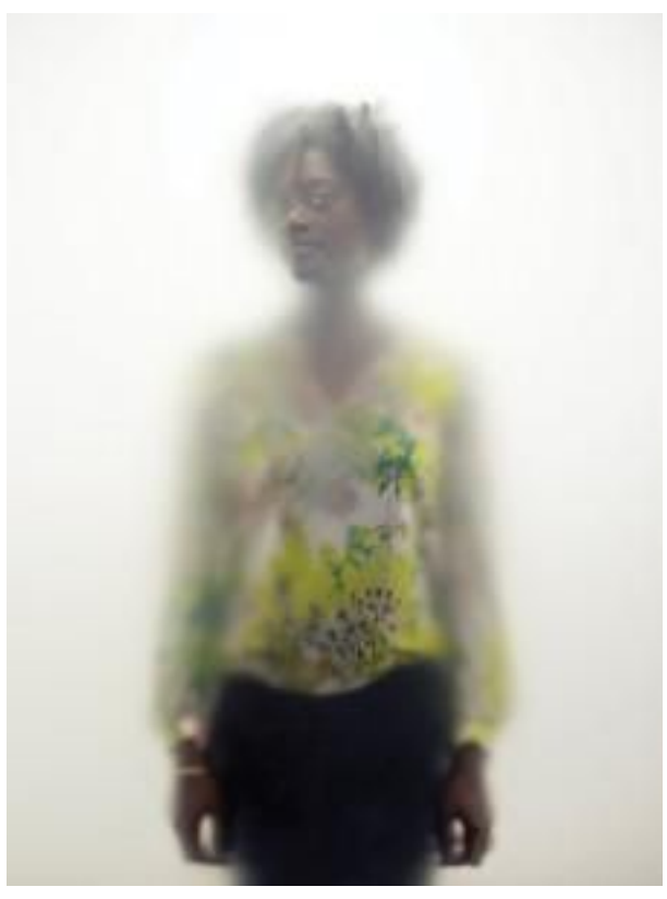
Ann Hamilton's ONEEVERYONE.Schwanda, 2014, is part of "Unknown: Pictures of Strangers" at the Transformer Station in Cleveland.