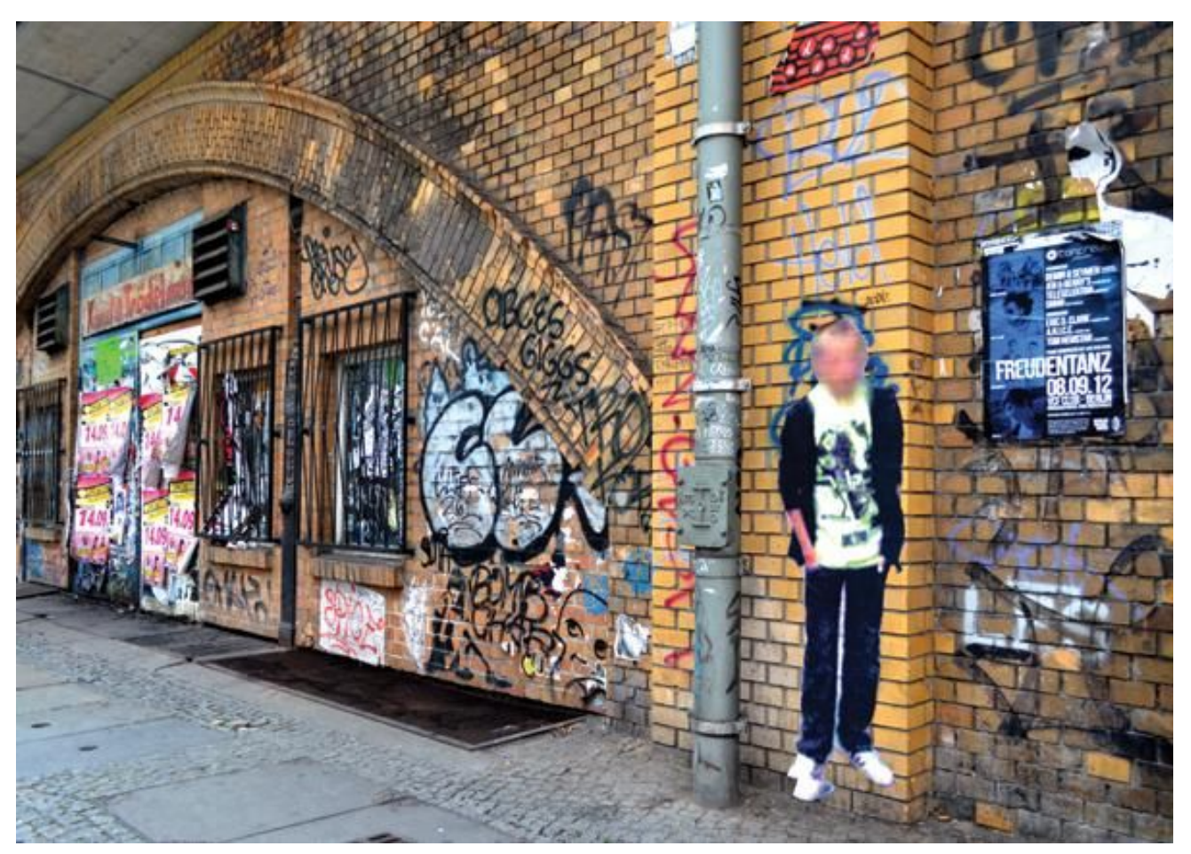
Paolo Cirio's No. 20 Berlin—Dircksenstrasse, Rochstrasse, Germany, 2012, from the artist's "Street Ghosts" series.

To underscore how troubling this situation is, many artists are using tools of surveillance and loopholes in privacy laws to create works that expose just how much has been lost. Paolo Cirio, for example, created a project called Street Ghosts in 2012, in which he tracked down pictures of random individuals who had been captured by Google Street View. He then printed them as posters and placed them at the very spots where the original images had been taken, injecting life-size representations of unsuspecting citizens into the landscape. According to Cirio, he did this to bridge the gap in people's thinking about the difference between online and offline reality. Some people reacted negatively to the project, posting comments on the artist's website. Others, however, asked Cirio to turn their Google Street View moments into life-size portraits.